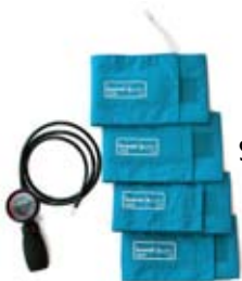
Summit 4 cuff kit

We offer a complete range of pressure cuffs to meet your vascular exam requirements.