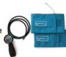
Summit 2 cuff kit